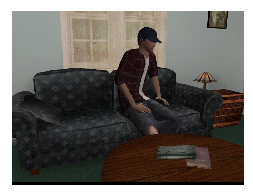
Fig. 2. Virtual Patient "Justin" in the clinician's office