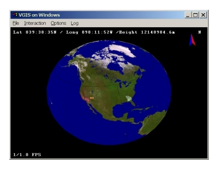
Figure 1: Orbital View from VGIS