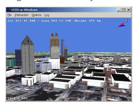
Figure 2: Surface View from VGIS

to understand the qualities and limitations of multimodal speech and gesture interfaces for particular tasks, rather than merely comparing performance with other interfaces.