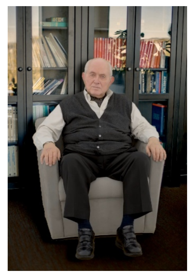
Figure 1. Pinchas Gutter, a holocaust survivor, as he appears on the screen talking to an audience

After the initial setup, no further interaction is required with the window displays, and the remainder of the demo consists of natural conversation between the demonstrator and the survivor. The demonstrator talks to the survivor through a microphone, using a mouse or similar pointing device for push-to-talk (push while talking, release when done). The