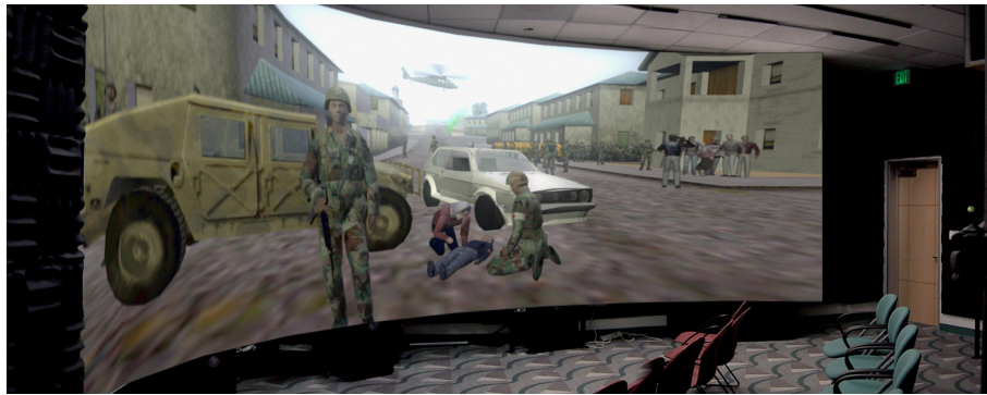
Figure 1: The Mission Rehearsal Exercise System

How can simulation be made more compelling and effective as a tool for learning? This is the question that the Institute for Creative Technologies (ICT) set out to answer when it was formed at the University of Southern California in 1999, to serve as a nexus between the simulation and entertainment communities. The ultimate goal of the ICT is to create the Experience Learning System (ELS), which will advance the state of the art in virtual reality immersion through use of high-resolution graphics, immersive audio, virtual humans and story-based scenarios. Once fully realized, ELS will make it possible for participants to enter places in time and space where they can interact with believable characters capable of conversation and action, and where they can observe and participate in events that are accessible only through simulation.