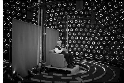
Fig. 2. Survivor in the lighting environment.

A key feature of natural conversation is eye-contact, as it helps communicate attention and subtle emotional cues. Ideally, future viewers will feel that the storyteller is addressing them directly. This could best be achieved if the survivor would maintain eye contact with the central stereo RED cameras. To create such eye contact, we placed the interviewer off to the side, so that their face was visible as a reflection in the stereo mirror box aligned with the central cameras. An opaque curtain, placed on the direct line of sight between the survivor and the interviewer, prevented the survivor from turning towards the interviewer directly.