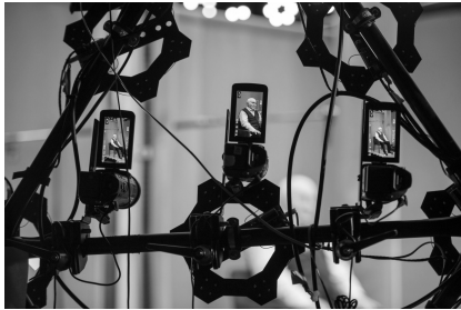
Fig. 1. Panasonic cameras used to capture multiple views of the interview.

minute continuous takes recorded on 512GB flash drives. In practice, this was not a problem, as it provided natural breaks in the interview. Scene illumination was provided by a LED-dome with smooth white light over the upper-hemisphere (Figure 2). This is a flattering neutral lighting environment that also avoids hard shadows.