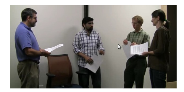
Figure 4: Role play session

Table 2: Scenario development time (detail)