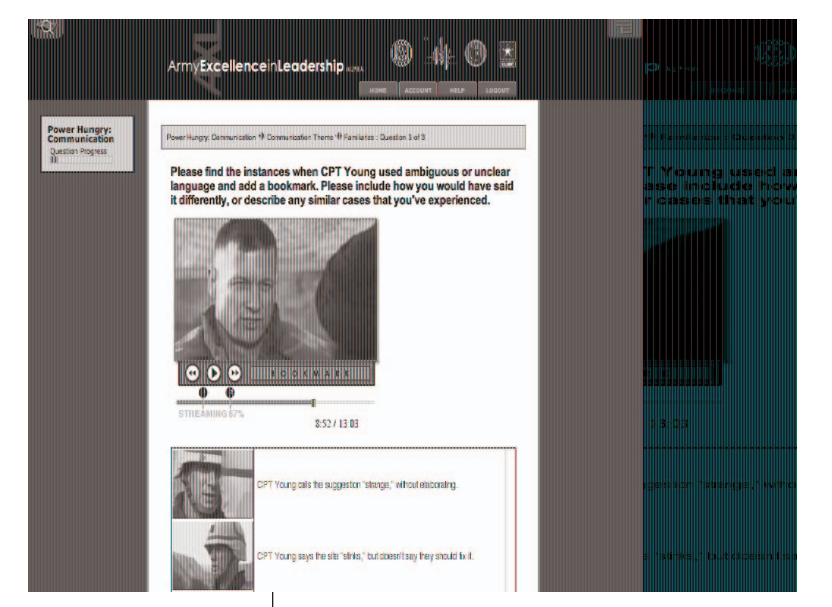
Figure 1. Army Excellence in Leadership prototype leadership development application.

active technologies that support case-method teaching using these films in a distance-learning context.<sup>3</sup>