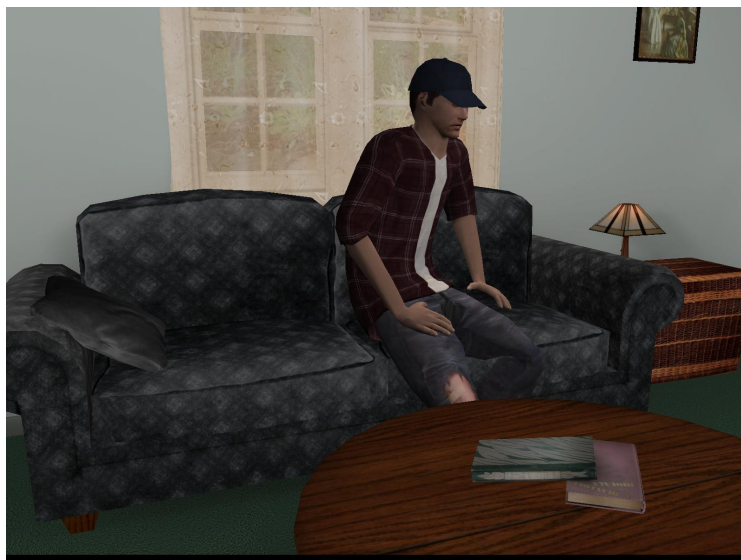
Fig. 2. Virtual Patient “Justin” in the clinician’s office