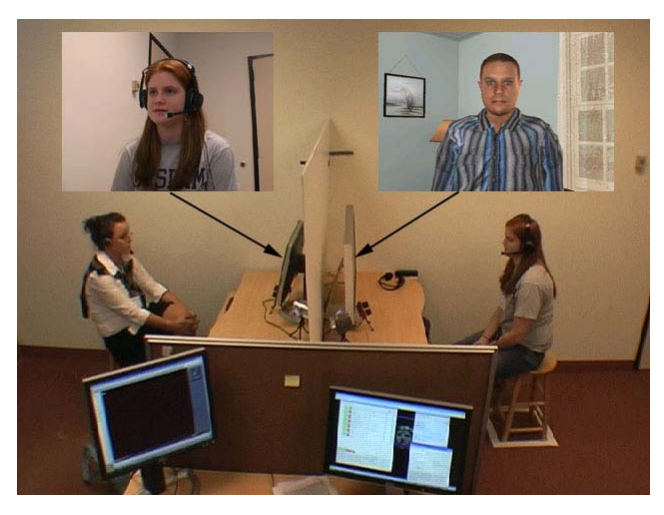
Figure 1. The setup for the experimental conditions

Speakers in all conditions (except the Face-to-Face condition) sat in front of a 30-inch computer monitor and approximately 8 feet apart from the listener, who sat in front of a 19-inch computer monitor. They could not see each other, being separated by a screen. The speaker saw an animated character displayed on the 30-inch computer monitor. Speakers in all conditions (but the Face-to-Face condition) were told that the avatar on the screen displayed the actual movements of the human listener. While the speaker spoke, the listener could see a real time video image of the speaker retelling the story displayed on the 19-inch computer monitor (see Figure 1). The monitor was fitted with a stereo camera system and a camcorder. For capturing high-quality audio, the participant wore a lightweight close-talking microphone and spoke into a microphone headset.