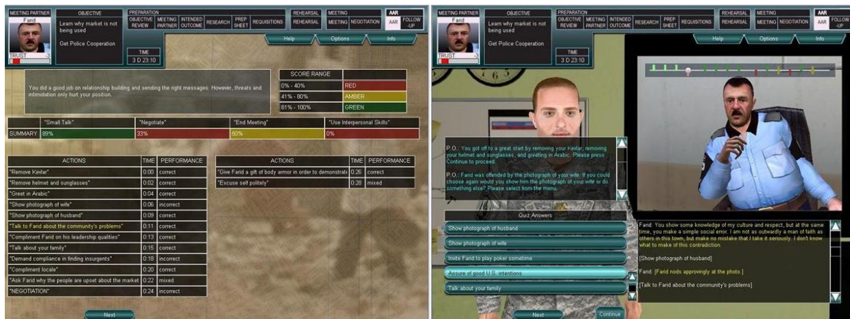
Figure 3. Screenshots of the scoreboard (left) and reflective tutoring (right) screens of ELECT BiLAT.

These simple mechanisms – counting and filtering – use the rudimentary student model to keep track of the learner’s progress and when the test is passed (e.g., a third error was committed), generation is as simple as looking up the message in a table.