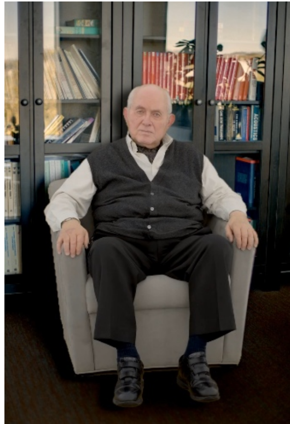
Figure 1. Pinchas Gutter, a holocaust survivor, as he appears on the screen talking to an audience

After the initial setup, no further interaction is required with the window displays, and the remainder of the demo consists of natural conversation between the demonstrator and the survivor. The demonstrator talks to the survivor through a microphone, using a mouse or similar pointing device for push-to-talk (push while talking, release when done). The