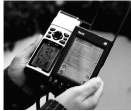
Figure 1: A Palm VII PDA with GPS receiver

To identify individuals with related interests, the agents use an online bibliography service that provides a list of the papers written by an individual. When a person is going to a meeting, their agent can check an online source to locate in-