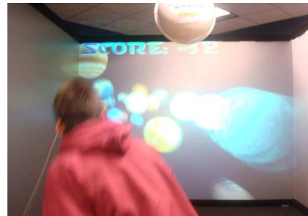
Figure 2: A neuro-typical individual playtesting Astrojumper.

We have recently finished doing preliminary playtesting on Astrojumper to locate any potential bugs and ensure the level of difficulty was appropriate. This playtesting was done with eight healthy, neuro-typical people, four between the ages of 11 and 16, two between the ages of 18 and 25, and two between the ages of 40 and 50. We took demographic information including their age, gender, exercise habits, and video game preferences. The participants played one session of Astrojumper and then filled out a questionnaire which included qualitative questions and 7-point Likert scale questions with higher numbers corresponding to a more positive experience. Overall, participants' ratings were extremely positive ( M = 6.50 , SD = .53 ) and qualitative feedback also suggested that the game was fun and motivating. The results were particularly encouraging