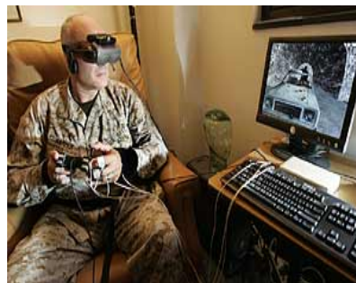
Figures 17, 18. Insurgent “Attack” ~ USA User Tests.