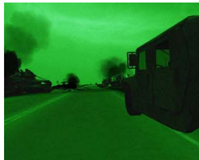
Figures 13, 14. Helicopter View ~ Night Vision View.