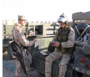
Figures 19, 20. User Tests – Iraq Combat Stress Control Team.