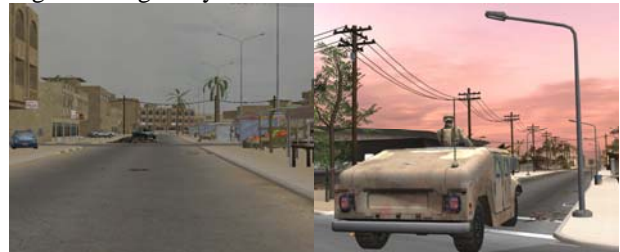
Fig. 3-4 Large City Scenario

Small Rural Village – This setting consists of a more spread out rural area containing ramshackle structures, a village center and much decay in the form of garbage, junk and wrecked or battle-damaged vehicles. It will also contain more vegetation and have a view of a desert landscape in the distance that is visible as the user passes by gaps between structures near the periphery of the village.