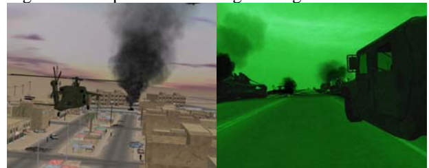
Fig. 14 Night Vision View

In each of these user perspective options, we are considering the wisdom of having the patient possess a weapon. This will necessitate decisions as to whether the weapon will be usable to return fire when it is determined by the clinician that this would be a relevant component for the therapeutic process. Those decisions will be made based on the initial user and clinician feedback from the clinical test application.