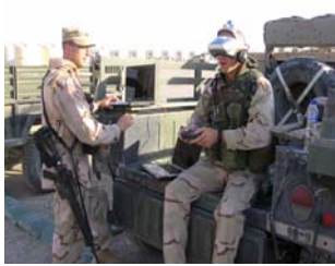
Fig. 16 User Tests - Iraq