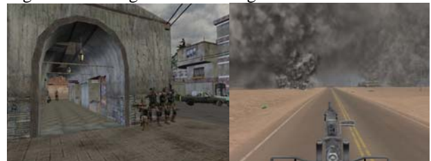
Fig. 12 Turret View