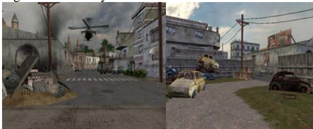
Fig. 1-2 Small City Scenario

This virtual environment was designed as a proof of concept demonstrator and as a tool for initial user testing to gather feedback from both Iraq War military personnel and clinical professionals. The resulting feedback has been used to refine the city scenario and to drive development of other relevant virtual contexts. Current ONR funding has now allowed us to evolve this existing prototype into a various versions that have undergone user-centered design feedback trials at sites throughout the USA with non-PTSD soldiers who have returned from an Iraq tour of duty. User centered feedback was also collected within an Army Combat Stress Control Team in Iraq (see Figure 3). The vision for the project includes both the design of a series of diverse scenario settings (i.e. city, outlying village and desert convoy scenes), and the creation of methods for providing users with different user perspective options . These choice options when combined with real time clinician input via