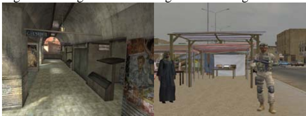
Fig. 10 “Flocking” Soldier