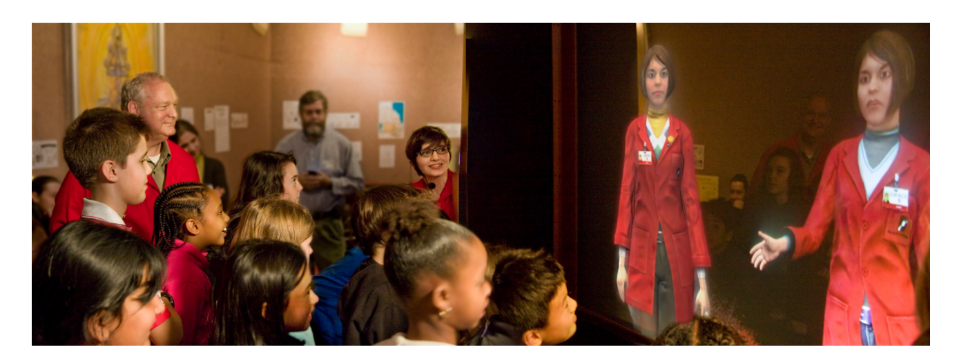
Figure 1: Visitors talking to the Twins at the Museum of Science.

Speech recognition (2) was performed by the SONIC toolkit (Pellom and Hacıoğlu, 2001/2005) until December 2010, and thereafter by OtoSense, a recognition engine that is currently being developed by USC; using OtoSense allowed appropriate customization of the speech processing front-end for the needs of the setup at the museum. Natural language understanding (3) and dialogue management (4) are integrated in a single component, NPCEditor (Leuski and Traum, 2010), a text classification system that drives virtual characters and is freely available for research