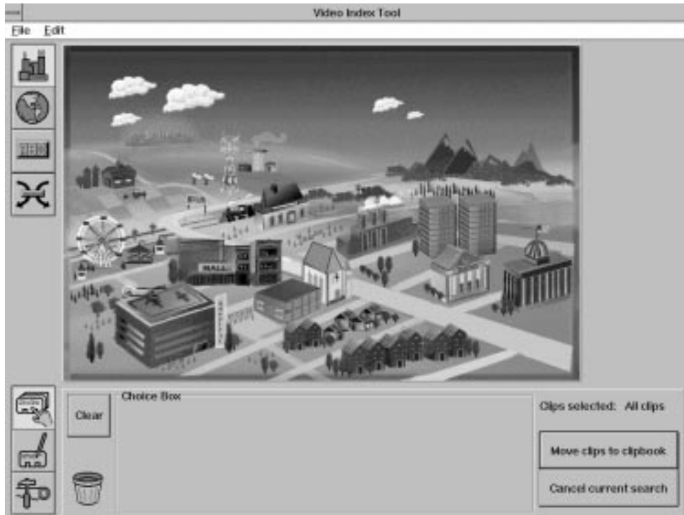
Figure 1: The stock video retrieval system showing the first picture of a zooming interface for types of places in the world.