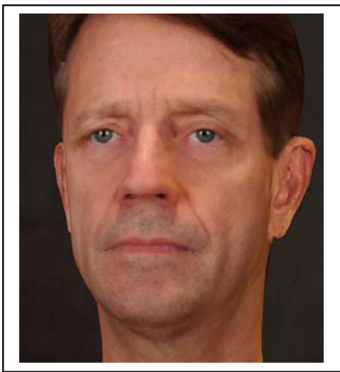
Figure 5. Synthetic Mentor

Realistic animation of a synthetic human is a difficult task due to the complexity of the human body, one that traditionally involves many digital artists in the special effects industry. We took advantage of motion capture technology to bring realism into the synthetic mentor at an affordable cost. Motion capture allows the accurate recording of live actors' motions. We used this technology to record a large database of speech related motions from a live actor. We then analyzed this data to build a generative statistical model of these actor's facial motions. This model used the database of motions indexed with speech. We organized this database according to the phonemes of the recorded speech: each phoneme is associated with a large number of motion fragments.