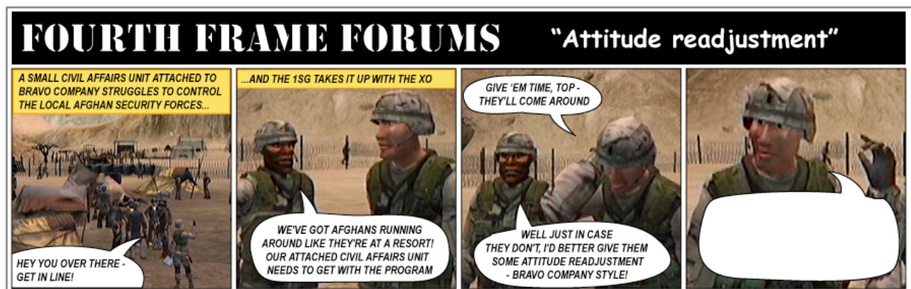
Figure 2. An example Fourth Frame Forum episode

The final step in authoring an episode was to realize the episode description as a four frame graphical comic using the conventions of the genre [7]. Artistically inclined developers may choose to hand-draw the episodes in the traditional manner of comic strip creation, whereas others may find it easier to start with photographs of posed character models that can be edited using commercial drawing applications. In developing four example Fourth Frame Forum episodes in support of US Army leadership development, we chose to start with single frames of a series of machinima-style cut-scene videos of 3D virtual characters taken from an existing training application [3]. Individual video frames were selected that approximated the intended descriptions of each comic frame, cropped to focus on the relevant characters and