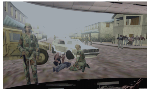
Figure 1: The Mission Rehearsal Exercise System, showing, from the left, the platoon sergeant, the injured boy and his mother, a medic, and a crowd.

We designed the Mission Rehearsal Exercise (MRE) system to demonstrate the use of virtual human technology to teach leadership skills in high-stakes social situations. MRE places the trainee in an environment populated with virtual humans. The training scenario we are currently using is situated in a small town in Bosnia. It opens with a lieutenant (the trainee) in his Humvee. Over the radio, he gets orders to proceed to a rendezvous point to meet up with his soldiers to plan a mission to assist in quelling a civil disturbance. When he arrives at the rendezvous point, he discovers a surprise (see Figure 1). One of his platoon's Humvees has been involved in an accident with a civilian car. There is a small boy on the