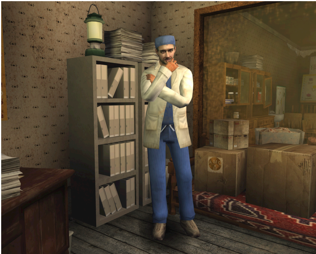
Figure 4: Negotiating with a Doctor