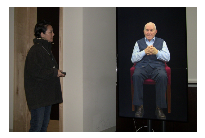
Figure 4: User talking to Mr. Gutter on a large TV.

itor for personal interaction to a large theatre projector screen, though our preferred display is an 80inch high definition television in vertical orientation (Figure 4). This allows showing the speaker at approximately life size, making it appropriate for oneon-one and small group interaction, as well as large group interaction in a theatre setting.